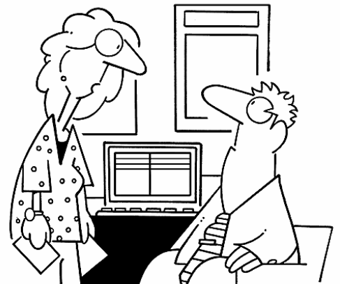
"The doctor will be in shortly to type on the computer and update your chart. If he has time, he will ask how you're feeling and take a look at your rash."

Lent is a time when we can grow closer to God and prepare our hearts for the true meaning of Easter. Be inspired. Be refreshed. Be renewed! For 40 days you will receive a short, practical and inspiring video in your inbox every morning to help you make this Lenten journey more powerful and prayerful. This program is FREE and you can sign up here: https://BruceDownes.org/Lent23 Go to BruceDownes.org for more information.